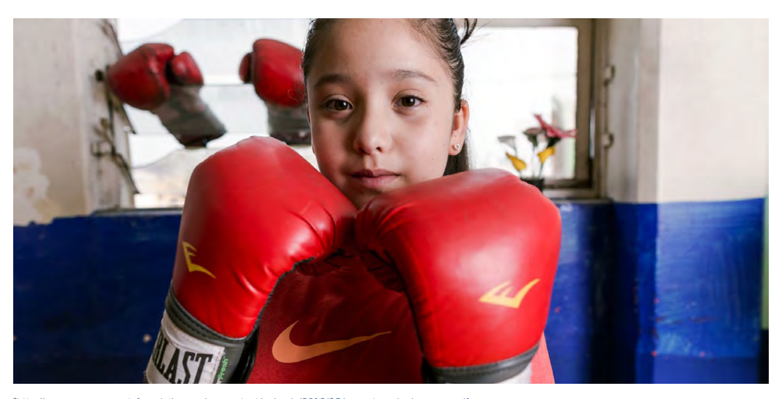
{\it $^3$} http://www.womenssportsfoundation.org/wp-content/uploads/2016/08/go\_out\_and\_play\_exec.pdf

Any of these behaviors, while not necessarily intentional, could influence how fulfilled and challenged a girl feels from their sport experience. Becoming more aware of biases about the role of women and girls in sport and using strategies to overcome them is fundamental to changing the way girls are treated in sport. Coaches also might simply be unaware of ways that girls are feeling unwelcome in the sport context or are facing barriers that they need extra support to overcome. Since coaches are at the core of how girls experience sport, we want to give coaches tangible tools they can use to create more girl-friendly sport and play environments.