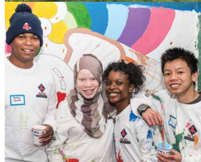
Above: Wally the Green Monster high fives an RBI softball player. Below: Red Sox Scholars team up with Rafael Devers and others for the Foundation's annual Martin Luther King, Jr. Day of Service.