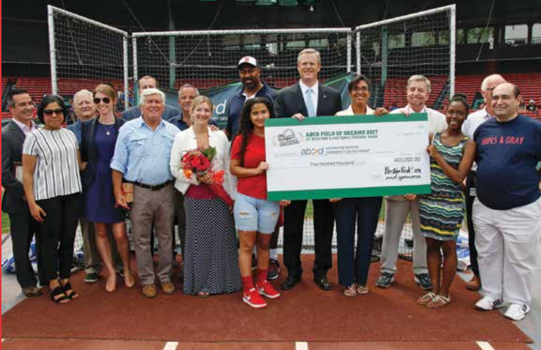
ABOVE: Massachusetts Governor Charlie Baker and leaders from Action for Boston Community Development helped celebrate the 20th anniversary of the ABCD Field of Dreams event which in 2017 brought in $400,000 for the SummerWorks job program, bringing the 20-year total to $5 million.